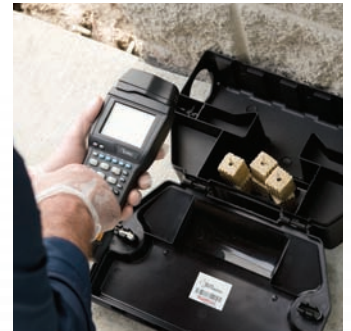
Work smarter. Take advantage of technology, such as Aegis bar coding, to expedite service.