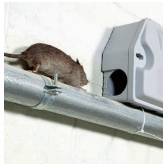
Liphatech products are designed to meet the wide variety of situations faced by rodent control professionals.